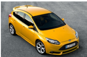
2013 Focus ST