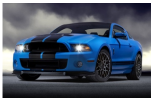
2013 Shelby GT500