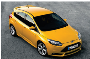
2013 Focus ST