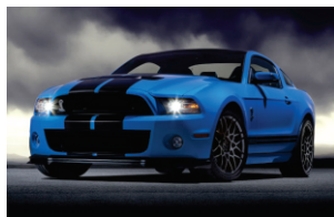
2013 Shelby GT500